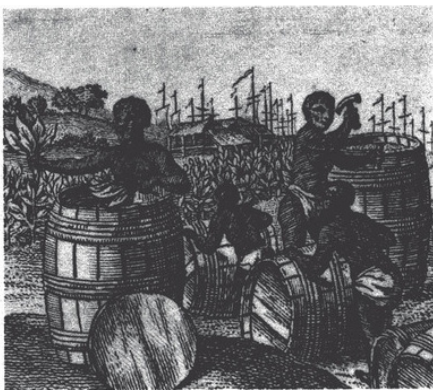
Virginia slaves crating a tobacco shipment